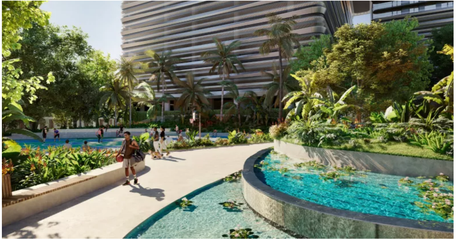
Rendering of exterior park space at Mercedes-Benz Places. JDS DEVELOPMENT GROUP

While driving an artificial intelligence-enhanced Mercedes-Benz, such as the new CLA, Places residents will be able to seamlessly move throughout their day. Transitioning from morning to night with work or play in between, with AI assistance.