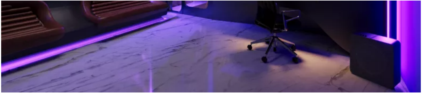
A rendering of a recording studio inside Mercedes-Benz Places.