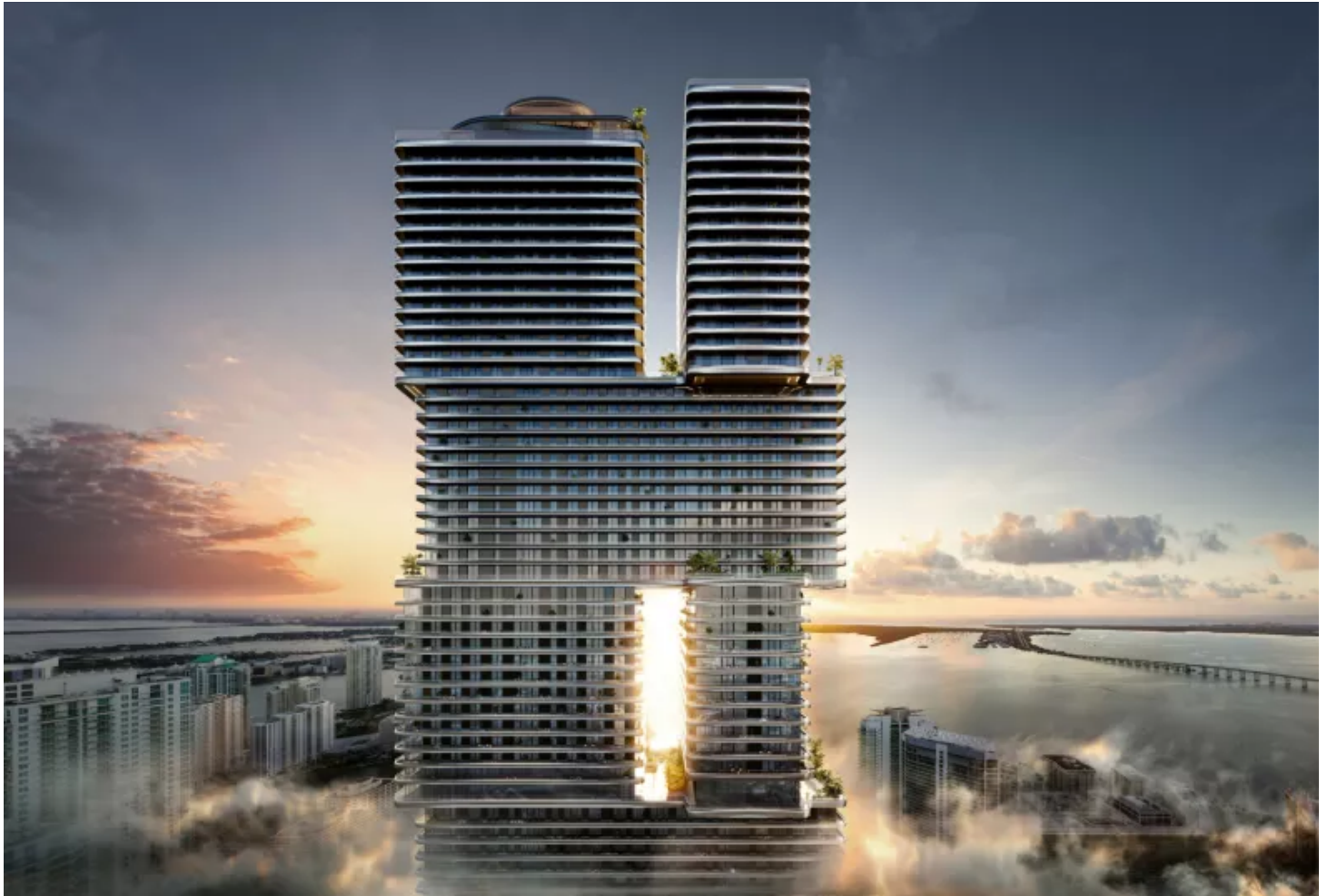
Rendering of the Mercedes-Benz Places towers. JDS DEVELOPMENT GROUP

The evolving juxtaposition of the two-tower structure gives the eye something unique to look at in a sea of light-colored towers as it moves toward the sky.