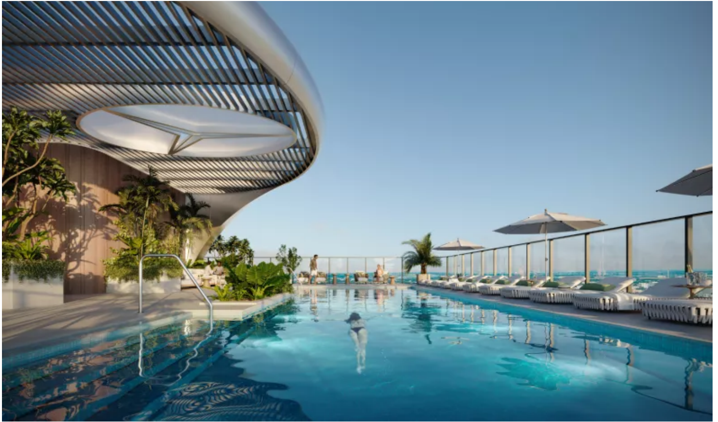
A rendering of one of the pools at Mercedes-Benz Places. JDS DEVELOPMENT GROUP

BREAKING LA Protestor Stomped By Police On Horseback As Clashes Escalate: Video