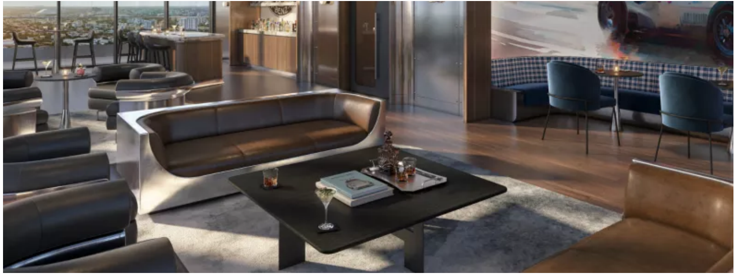
A rendering of the interior of a condo inside Mercedes-Benz Places. JDS DEVELOPMENT GROUP