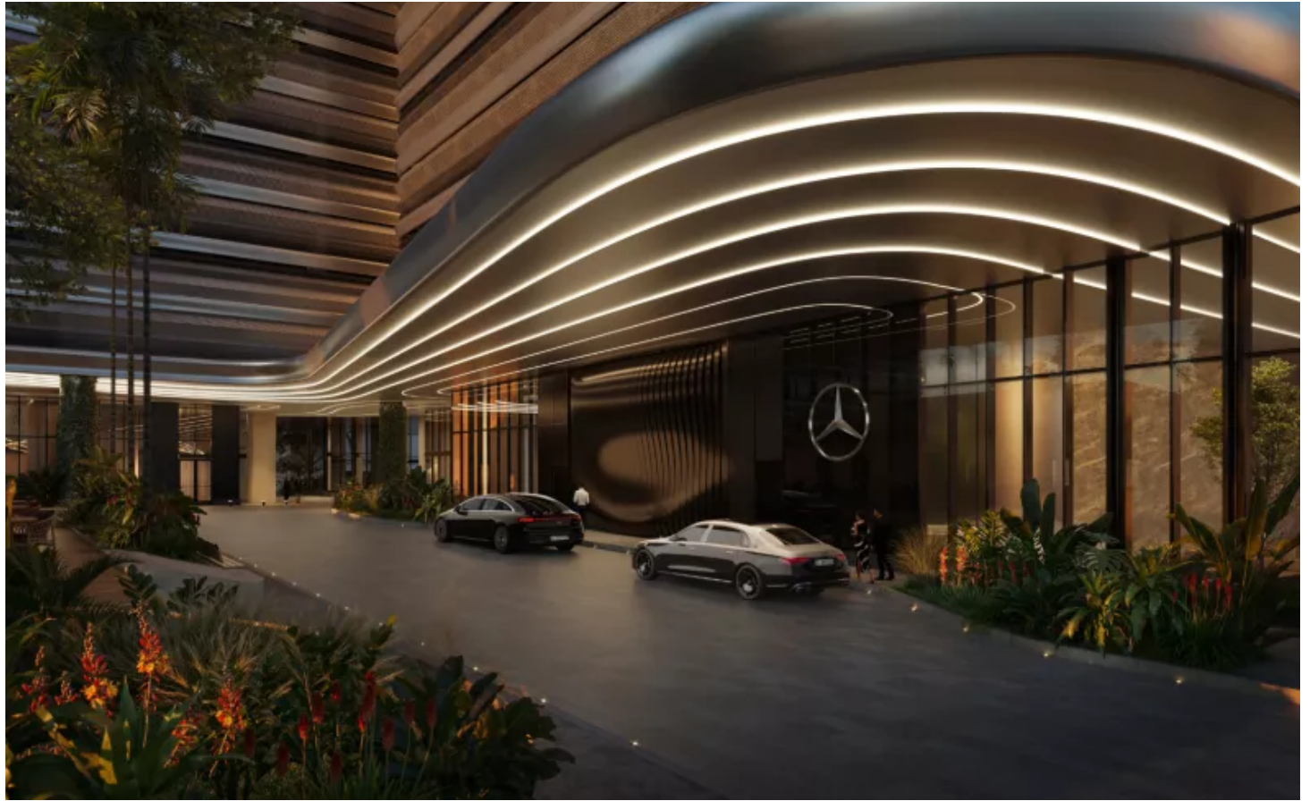
Rendering of the porte-cochère at Mercedes-Benz Places. JDS DEVELOPMENT GROUP